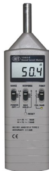
Figure 1 1565-E Sound Level Meter

It consists of the following elements: a microphone to pickup sound; an amplifier, to raise the microphone output to useful levels; a calibrated attenuator, to adjust the amplification to a value appropriate to the sound level being measured; a display, networks, to adjust the frequency characteristic of the response (A or C weighting) ; and an output connection, to accommodate additional measuring equipment. It covers the sound-level range from 35 to 130 dB in 2 overlapping ranges.