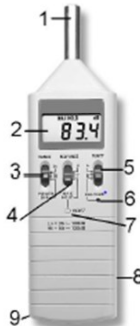
Figure 3-1 Key Features

Note: The threaded tripod mount screw hole is on the center rear of the meter (not shown).