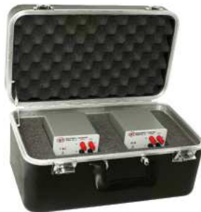
SRC-100 Transit Case for 2 units

changes during transportation or shipping. It is suitable for transporting and storing two or more units.