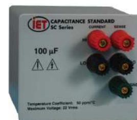
SCA-100μF (values > 1μF)