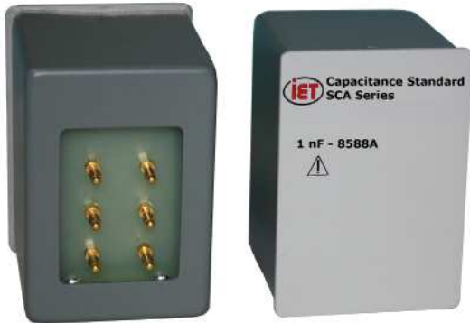
SCA-1nF-8588A Direct Connection